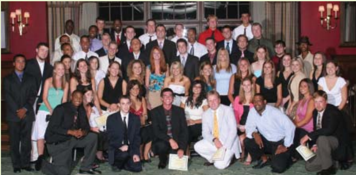
Oakwood's 2005 scholarship award winners.