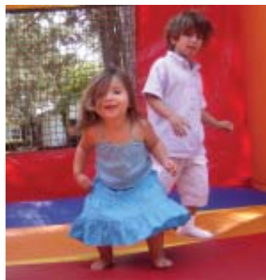
Jumping in the castle...