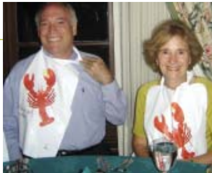
Who are these folks?